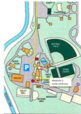
Parking and Notebook Location

Necessary phone numbers: Shift reporting if there are any issues: 602-619-8326