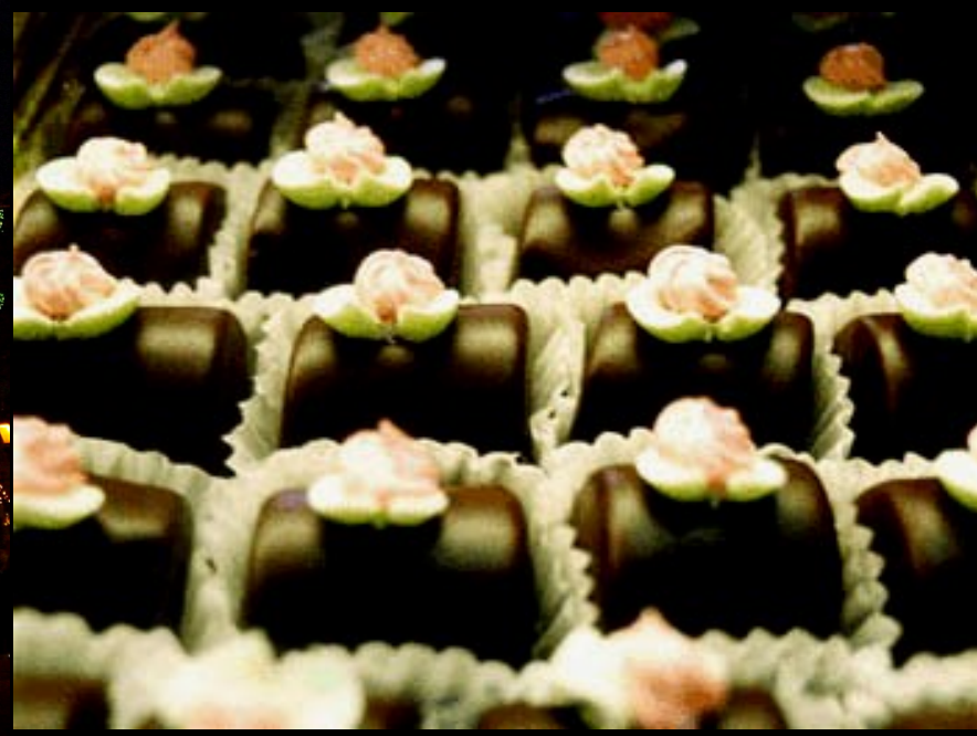
Click the picture to see a list of upcoming events in City of Glendale!